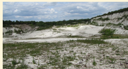
East Pit, Cherry Hinton

the sites and to promote their use for research and education. LGS may be obvious geological sites such as pits and quarries that expose the bedrock but can also be landscape features such as springs, ponds, meres and water channels . Sites that tell the story of the county's geology-linked industrial and economic heritage may