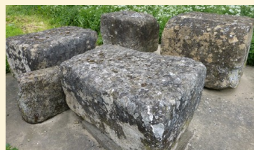
Blocks of Barnack limestone at the Great Fen LGS (Whittlesea Mere)

It is also possible to designate a building for its building stones including the ' exotic ' cobbles brought by glaciers and now found across the local countryside. Even a view could be designated if it is of landscape significance.