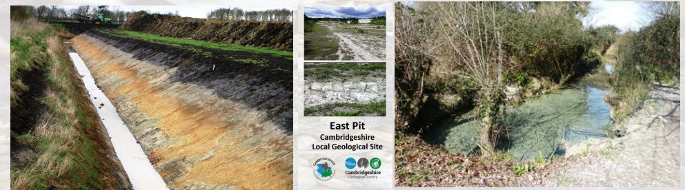
Examples of current LGS: (top) Orwell Clunch Pit; Great Fen - Holme Fen and Whittlesea Mere; East Pit, Cherry Hinton (cover of LGS leaflet); Nine Wells chalk springs.