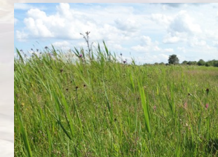
2 Candidate sites at Wicken Fen: Sedge Fen & Reach Lode (since designated as LGS).